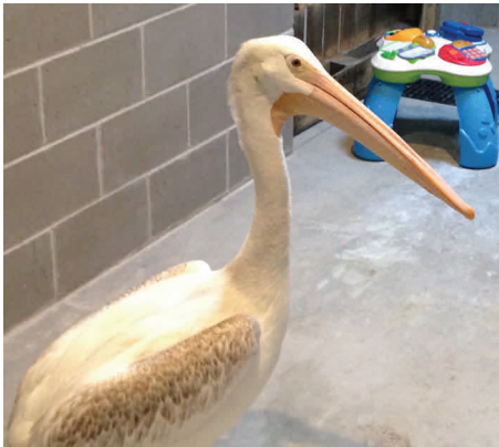
Bubbles the pelican, above, prefers to eat his fish whole, rather than chopped, according to his zookeepers.

A second American white pelican ( pictured below ) was added to the collection this month. He comes from a rehab facility in Northern Wisconsin. An eye injury makes him a poor candidate for re-release into the wild. Both pelicans are residing in the new Cornerstone Animal Hospital. Once they have completed quarantine, it is likely that they will be moved to the Tortoise building where visitors will be able to view them throughout the winter.