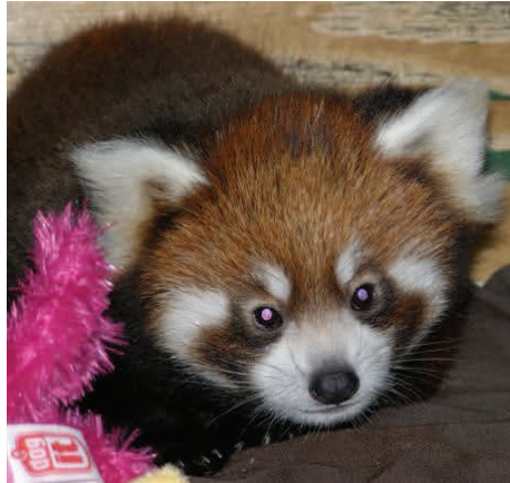
Qiji the red panda, above, was born at the Valley Zoo & John Janzen Nature Center in Alberta, Canada, to parents Pip and Ralphie.

A female red panda ( pictured above, right ) was transferred to the NEW Zoo from the Nashville Zoo in accordance with SSP recommendations. Qiji, a four year old female, arrived here on 11-19-15. She is currently residing in the exhibit adjacent to the one housing resident male Zhin-Li. The two will have time to get to know each other from a distance before they live together. We have high hopes that this “arranged marriage” will result in the birth of cubs in the summer of 2016. Red Pandas are critically endangered in the wild due to habitat degradation. The SSP captive breeding program is designed to ensure a genetically healthy and di-