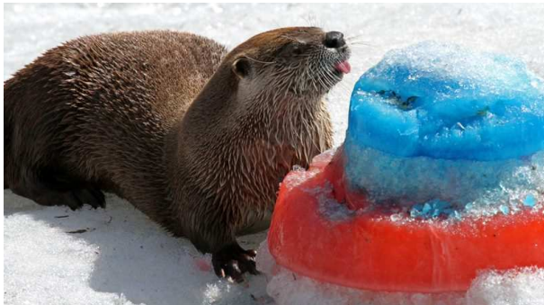
Visitors and animals alike had a wonderful time at the Birthday Party for the Animals Event on April 5th!