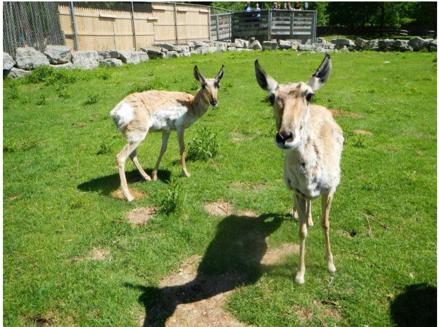
Pronghorns Sherman and Medora get along very well!

animals) than exist in the wild (more than 100 animals). Captive bred wolves continue to be released into the wild to bolster the population.