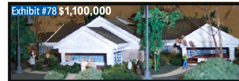
(New Education & Conservation Center to be built as soon as funds are raised)

The mission of the N.E.W. Zoological Society, Inc. is to assist the NEW Zoo in enhancing the education, conservation, and recreation programs that it offers.