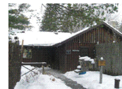
(Aurelia Barth Center, Education Center, built in 1953)

The existing Aurelia Barth Education Center was built in 1953 and has been utilized to the full extent. The small rooms can no longer accommodate the rapid growth of our education classes, volunteers, visitors, and zoo staff.