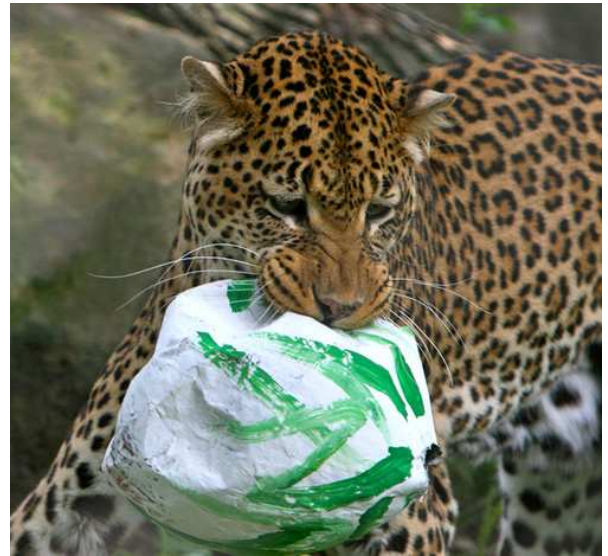
This leopard in Baltimore enjoys a paper maché creation made by his keepers!

You can design your very own Paper Maché Creation to be used as enrichment by following our guidelines below. Many animals enjoy ripping and tearing into things to find their food, and a paper maché creation can be filled with all sorts of fun and tasty treats. Our Zoo Keepers know exactly which animals enjoy the paper maché, and exactly what kinds of treats go best in a paper maché creation. All you need to do is make a creation, let it dry, decorate it if you want, then drop it off at the Zoo's Visitor's Center. Our keepers will do the rest.