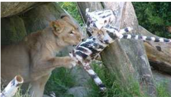
A lioness at the Wellington Zoo in New Zealand enjoys a zebra-shaped paper maché creation filled with meat!

Boxes (Kleenex and cereal boxes, etc): cardboard boxes MUST NOT contain any staples, sticky tape, thick glue, or plastic. REMOVE all of those objects from the box before covering it in paper maché. Animals that swallow those things could get sick or even die.